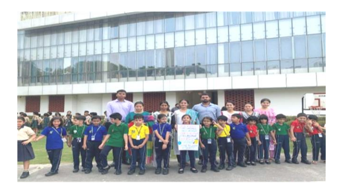
Activity on Swachch Bharat and board decoration for Sports Day at Samurja International School